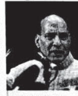
This will be the fourth meeting of the Chief Ministers of States, which share International Borders, called by the Home Minister.

Union Home Minister Rajnath Singh and Chief Ministers and Home Ministers from India-Bangladesh border states will take stock of the infiltration of thousands of Rohingyas and Bangladeshis on December 7 in Kolkata. The meeting would also consider the issues regarding cross border smuggling, fake currency and narcotic drugs cartels.